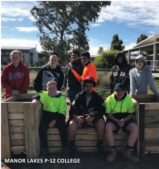
MANOR LAKES P-12 COLLEGE

How good is it to see students building significant, highly visible projects on school grounds, developing their own (and others) pride in the school, as well as pride in themselves? HoL becomes a hook that keeps these students connected to school by catering to the different way they learn, and supporting them to fully participate in school life.