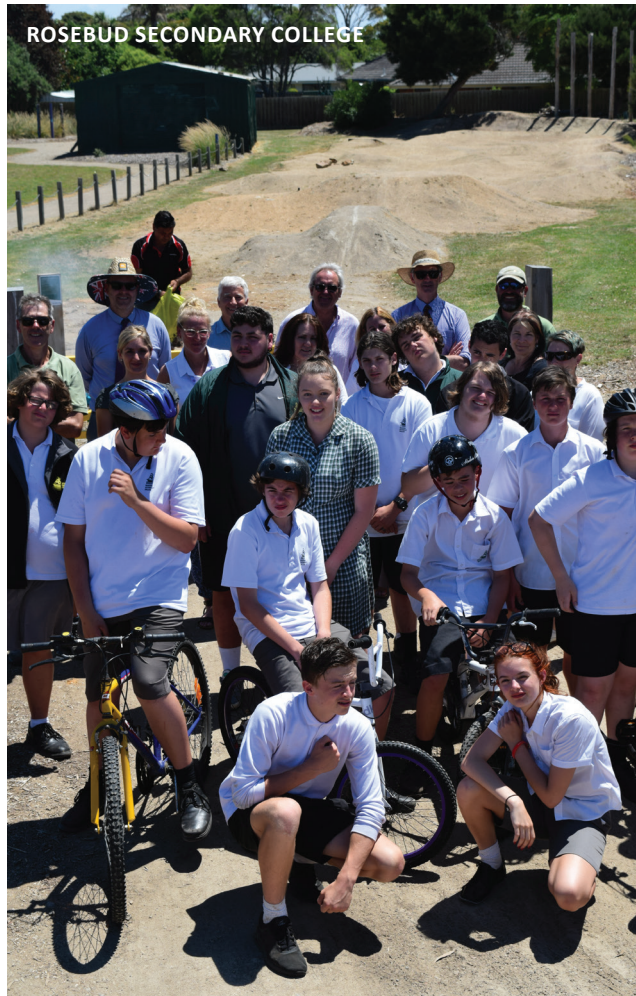
ROSEBUD SECONDARY COLLEGE

The HoL team at Manor Lakes P-12 College hit the ground running, starting Hands on Learning early in 2017 and building and installing outdoor seats at the school by the end of Term 3.