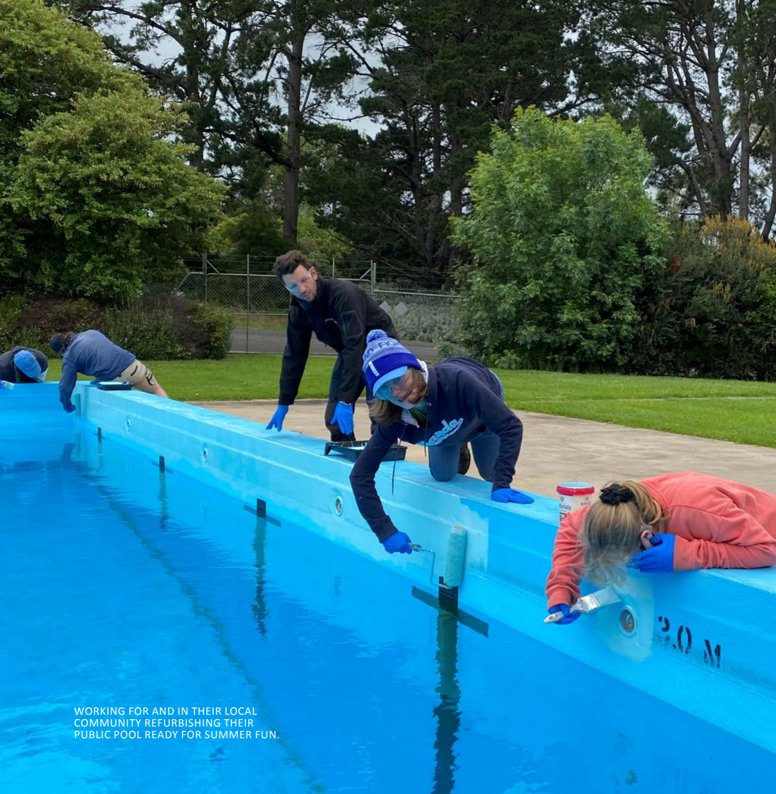
WORKING FOR AND IN THEIR LOCAL COMMUNITY REFURBISHING THEIR PUBLIC POOL READY FOR SUMMER FUN.

"The simple reason we have invested in Hands on Learning at Kurnai College for the past ten years is that our classroom teachers are such strong advocates of the program. They recognise the change in these kids, they see the results in class and the way doing HoL one day a week moves these kids forward. We are talking about a change in attitude and a greater willingness to engage in what's happening in the classroom. The HoL kids are more positive about being at school, feel like they belong, and that there is a place for them. Many more kids could benefit so maintaining their place in HoL is a real incentive for the HoL kids to sustain their positive attitude and behaviour across the school."