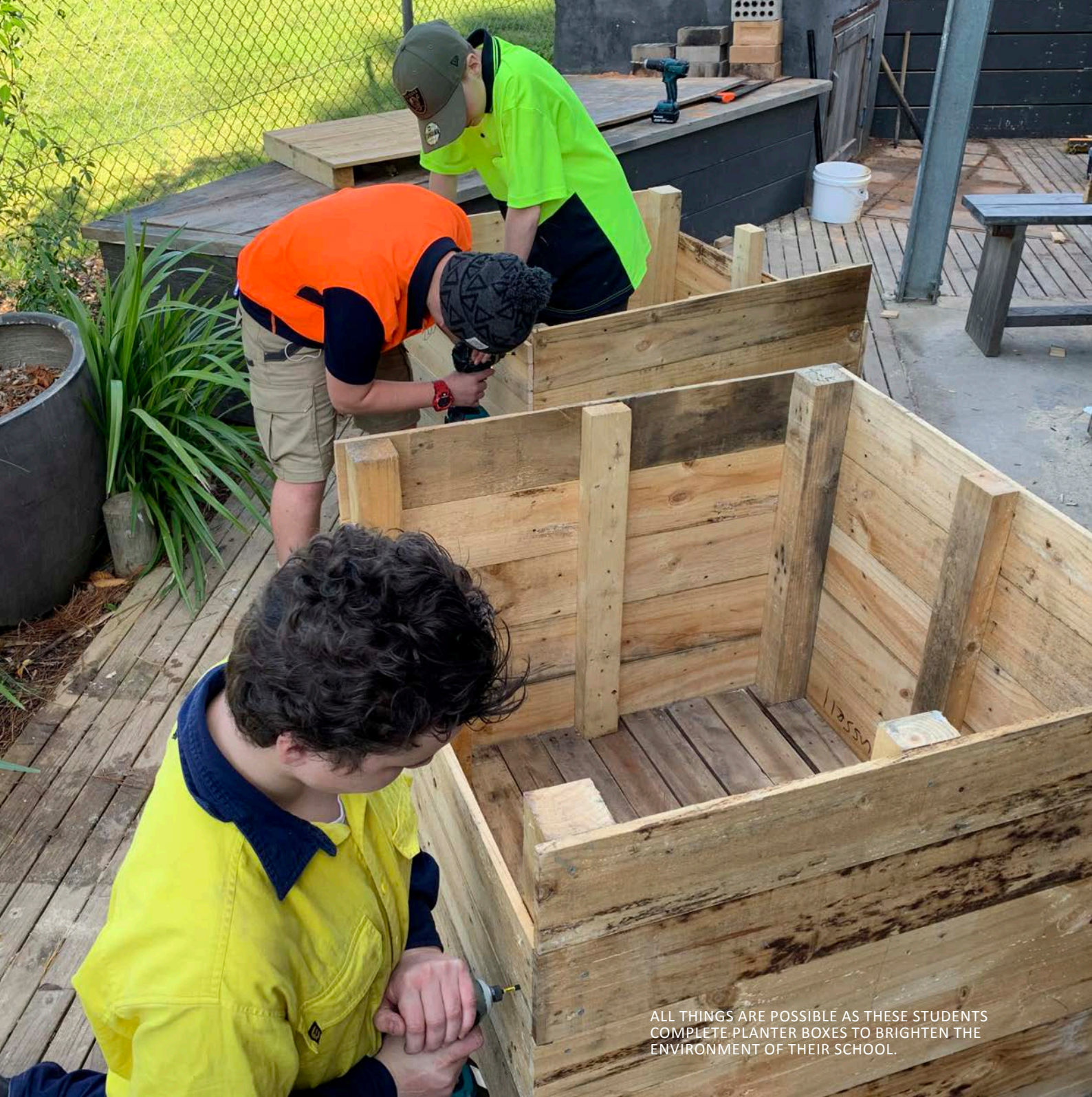
ALL THINGS ARE POSSIBLE AS THESE STUDENTS COMPLETE PLANTER BOXES TO BRIGHTEN THE ENVIRONMENT OF THEIR SCHOOL.